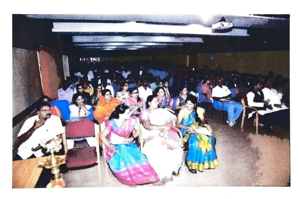
Eye Donation awareness program - 14th July 2017

Rotaract Club of MES Institute of Management had organized Eye Donation awareness program, on 14<sup>th</sup> July 2017, in association with Indian Red Cross, Bangalore Karnataka branch. The program was conducted in the seminar hall of MES Teachers College. About 50 students participated as volunteers from our college, in creating awareness among the community about eye donation, which is an act of giving the gift of vision to the needy ones.