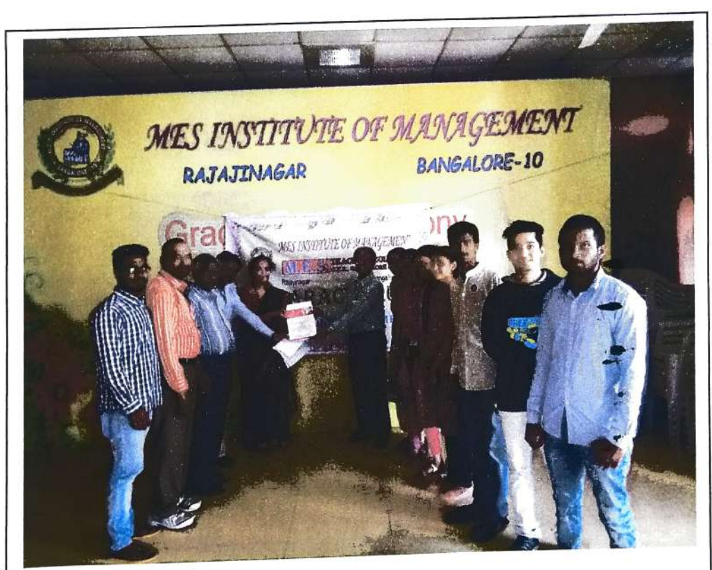
A Blood donation camp - 6th October 2018

A Blood donation camp was conducted on 6<sup>th</sup> October 2018 at 10:00 am in MES Institute of Management, Rajajinagar, Bangalore with a concept called "Save a life, Donate Blood". Both NSS & Rotaract club had jointly organized this event in association with Rashtrothana Blood Bank, Bangalore. The event was successful in collecting 61 units of blood. A certificate of appreciation, donation card and refreshment were given to blood donors. The responsibility of the effective and proper use of the collected blood was taken by the NSS unit & Rotaract club of the college.