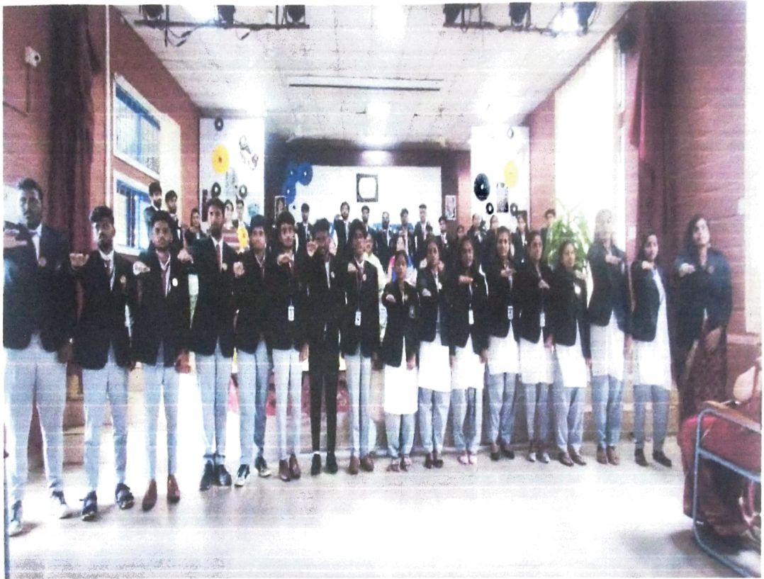
Student Council Taking Oath in Investiture Ceremony