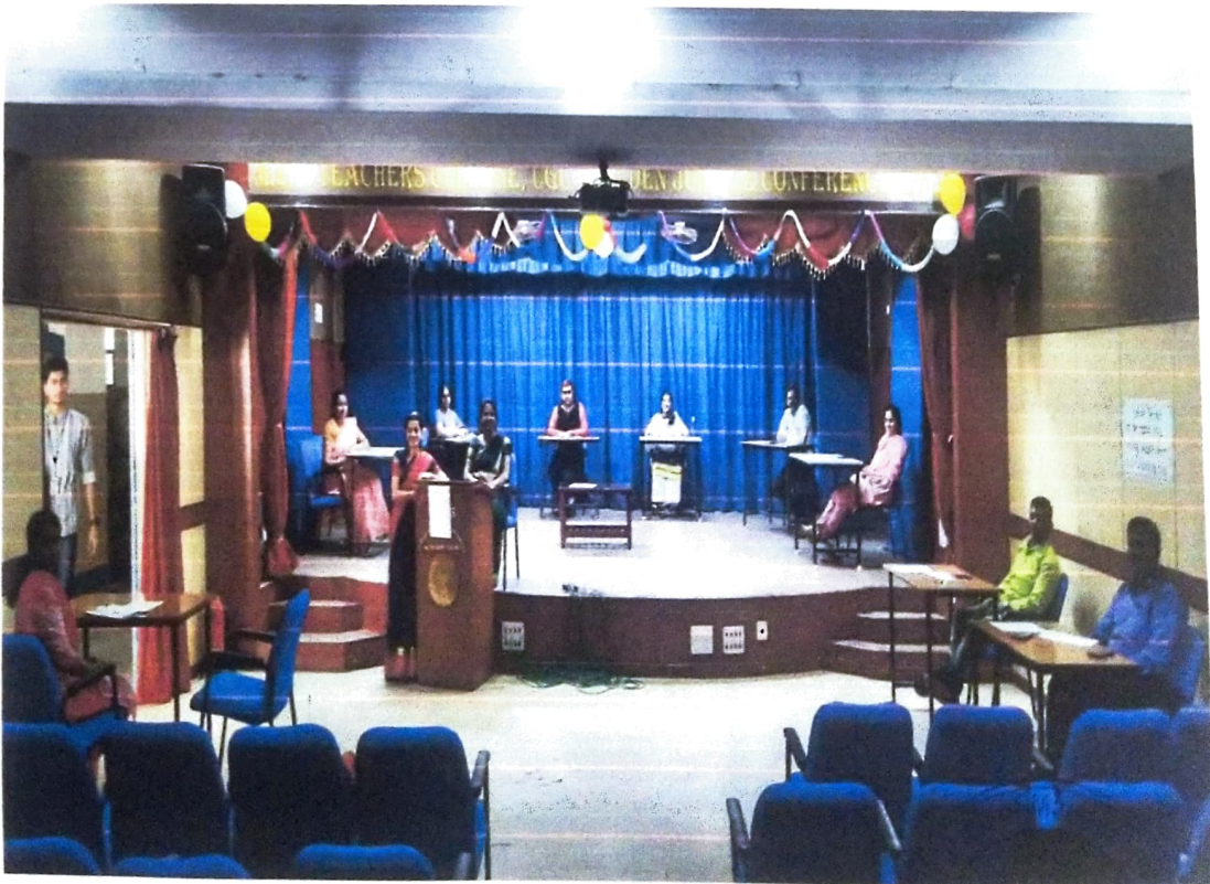
Conducting of student council election 2022-2023