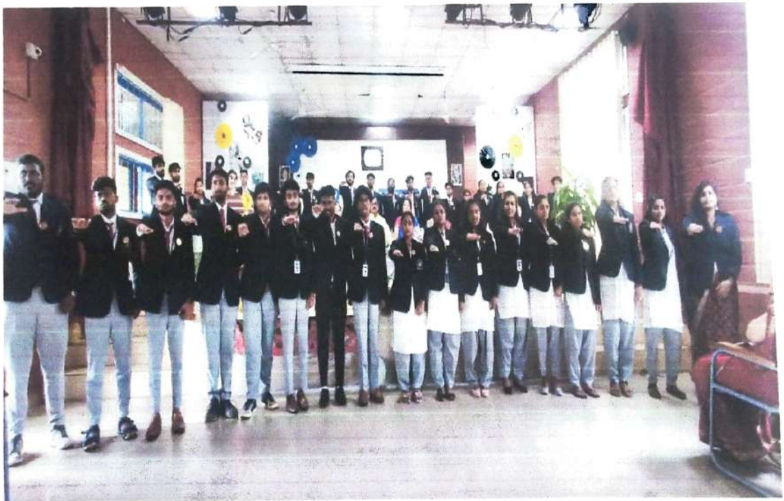
Student Council Taking Oath at Investiture Ceremony

The two days onstage and off-stage events included solo dance, solo singing, group dance, group song, rangoli, mehendi, best out waste and face painting competitions.