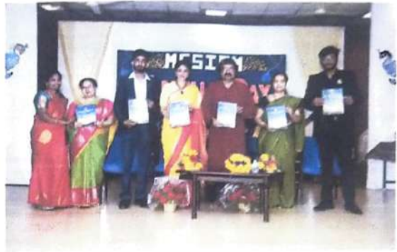
Chief Guest released Annual Magazine