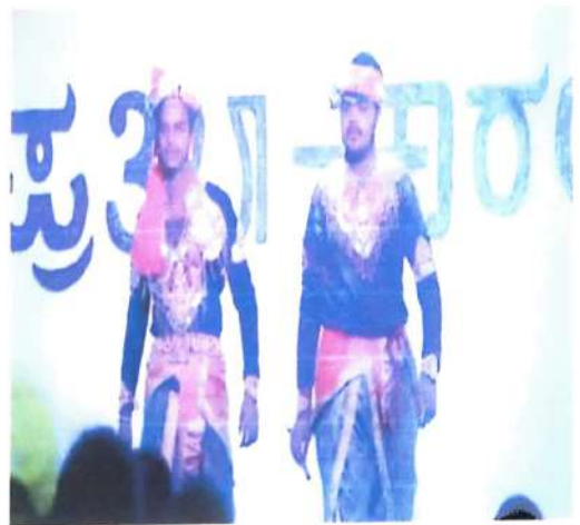
Students participating in various Off-stage and On-stage events