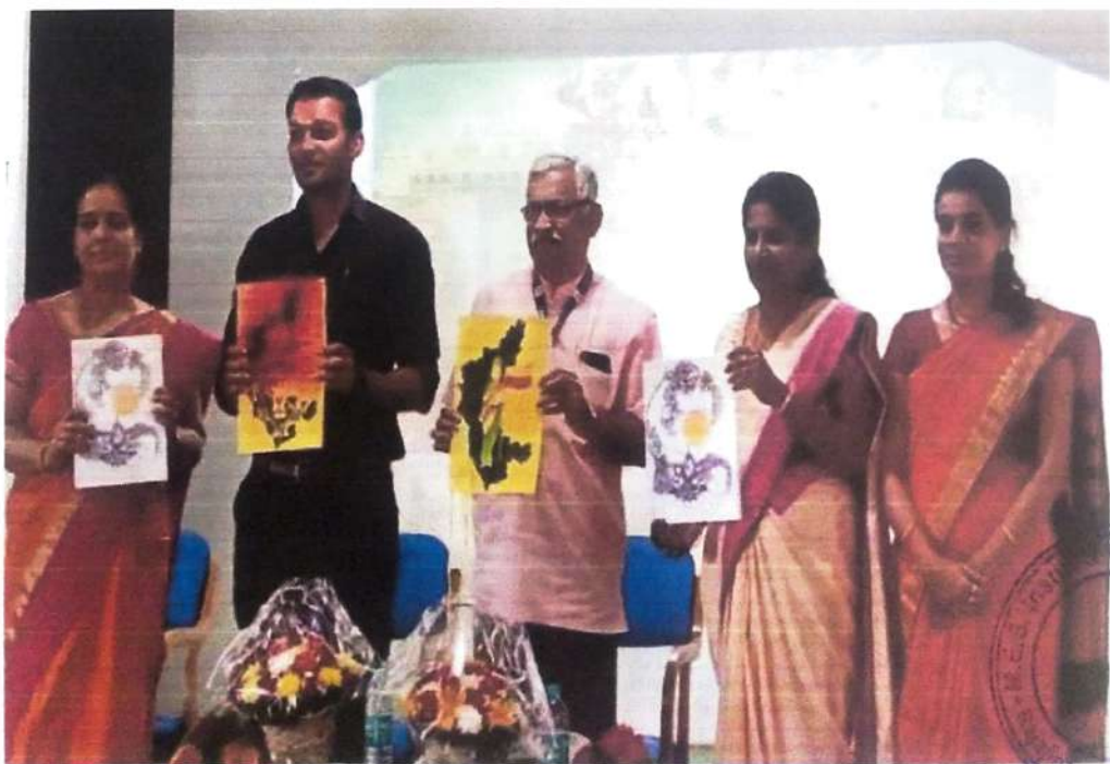
Banqalore Urban, Karnataka, India 25/1, 17th Main Rd, 2nd Block, Basaveshwar Nagar, Bengaluru, Long 77.552956° Lat 12.995436° 05/11/2022 10:37 AM