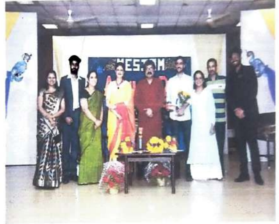
Chief Guest felicitation & Honoring of the Best Student Award