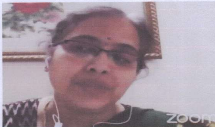
presided by principal