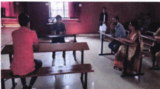
Debate: Tarangini, Department of Hindi

Ankura an inter colligate Management fest is organised where various events like product launch, business quiz, best manager, and crises management, students from various colleges participate and thereby get exposure to learn practically.