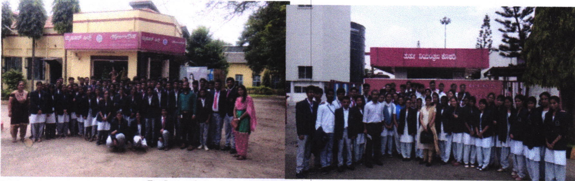
Industrial visit: KSIC & Coco cola

Field visits/Industrial visits are organised for both BCom and BBA students which exposes students to learn practically about industrial operations.